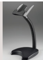
> AS-8120 stand