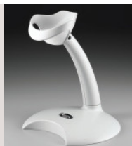
> AS-8000 stand