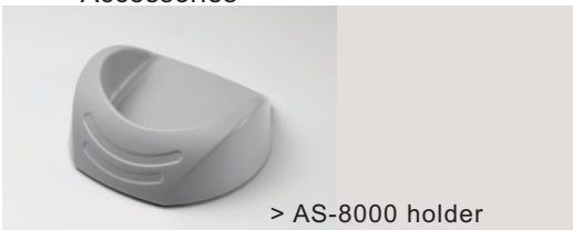
> AS-8000 holder